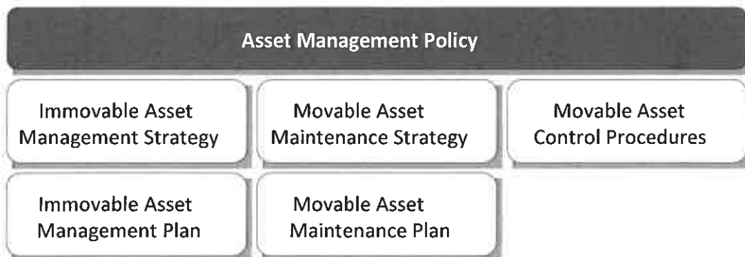
Figure 1: Proposed policy and strategic framework

The policy approach has been to firstly focus on the financial treatment of assets, which needs to be consistent across both the movable and immovable assets, and secondly to focus on the management of immovable assets as a fundamental departure point for service delivery. This arrangement is summarised in Figure 1.